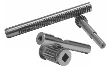
Rack & Pinion