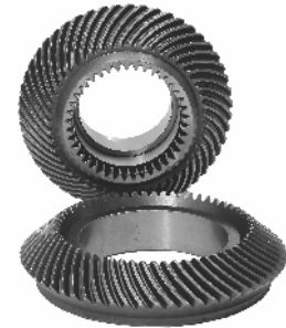
Spiral & Straight Bevel Gears