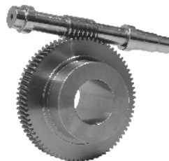
Worm Gear & Worm Shaft